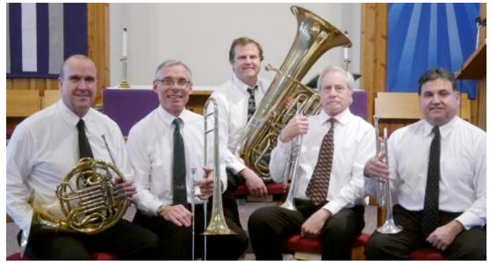
The Washington Brass Quintet

There is no admission charge. A free will offering will be taken with all proceeds to benefit the MABO orphanage in Haiti. It is our hope that this will provide an opportunity to make more people aware of the needs of the children of MABO. Spread the word!