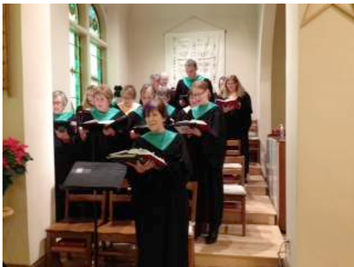
Advent's Senior Choir gloriously singing and showing their spirit in green and gold.