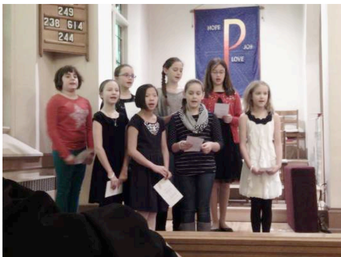
Advent Lutheran Children's Christmas Program