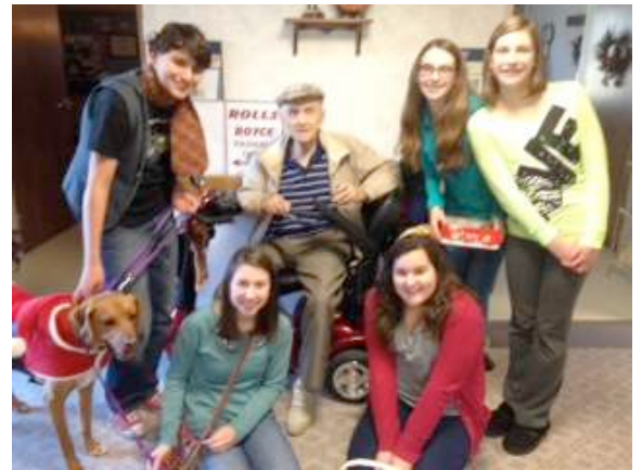
Youth Group missions to LaSata with Hoover Slavin the Companion Dog

The New Year brings with it hope and excitement for new opportunities. After Christmas break, classes will resume on Wednesday, January 7 th at 7:00pm . We want to remind ALL Youth that even if you haven't attended our Wednesday night meetings in the past, we would love to have you join us and see what it's about. We explore putting faith to action in our everyday lives through discussions, service projects, and social activities. Everyone is welcome, so feel free to bring a friend! This month we will talk about the lives and teachings of both Martin Luther King Jr. and Martin Luther.