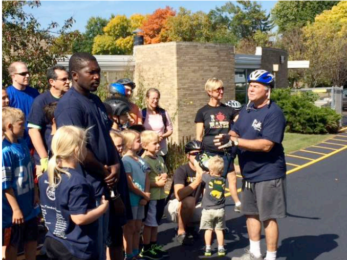
Westlawn Elementary families, the community and Advent members participated in the bike ride supporting MABO and HAITI. Held on September 28, 2014 and raising $1609.00 WAY TO GO!!!